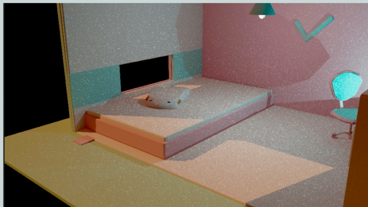
Rendered version in maya

The lighting of the scene is like this because I like the warm light when dusk com and to make a contrast, I used cold colour as light come from the iPad.