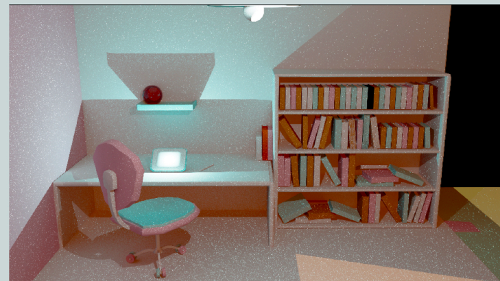
Rendered version in maya